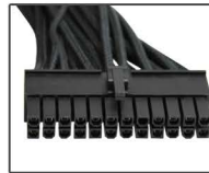
1X 24 Pin ATX

You can also count on EVGA to provide the utmost reliability and performance, with 100% Japanese capacitors and a durable 2-ball Bearing fan. The NEX650G Gold is designed from start to finish to be the best choice for today's most demanding enthusiast computers. Get to the next level with the EVGA NEX650G Gold Power Supply!