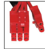
4X 6+2 Pin PCI-E