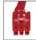
1X 6 Pin PCI-E