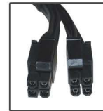
2X 4+4 Pin EPS12V